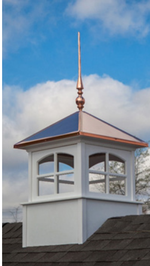
Cupolas & Finials